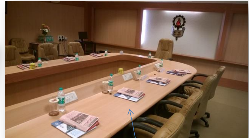
Print Media Promotions On-Table during CEO/CMD Visits in Director's Conference Room